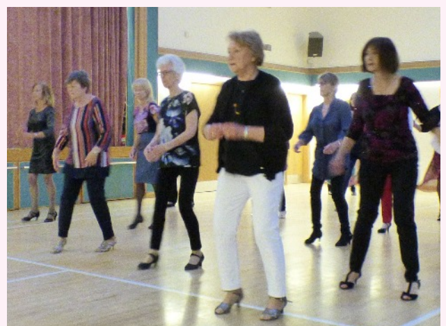
[ Both pictures from at a Saturday fundraiser in April ]

For further information and to book your place, contact Bev on 01458 446565 or 07542 552721