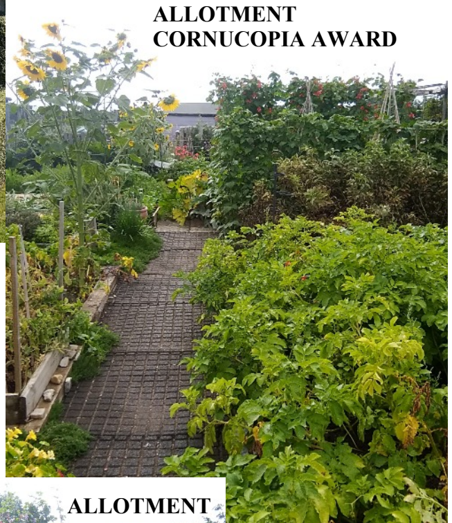
ALLOTMENT CORNUCOPIA AWARD