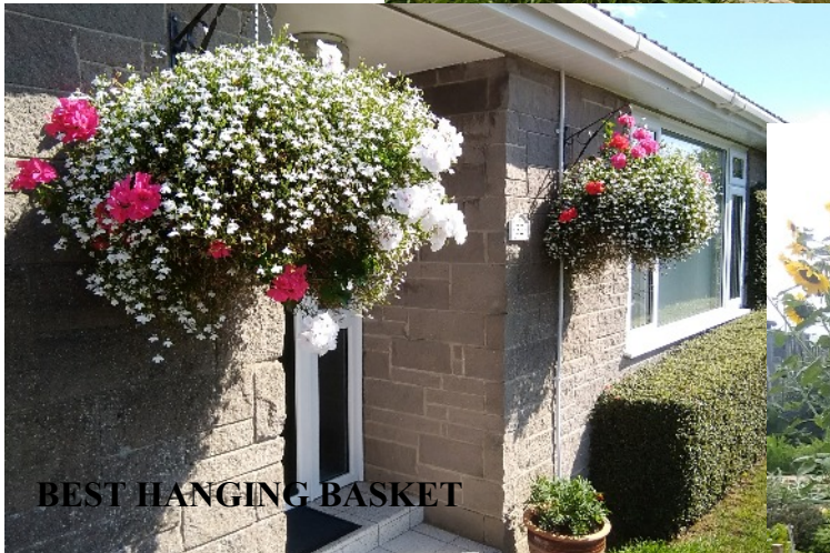
BEST HANGING BASKET