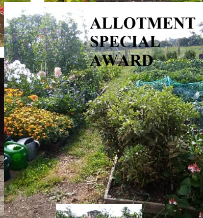
ALLOTMENT SPECIAL AWARD

There were comments about productive and well maintained allotment plots and congratulations for a first year success. The overall tidiness and good maintenance of the entire allotment field was also noted by this year's judge - seen here relaxing in the Allotment Society's Communal plot.